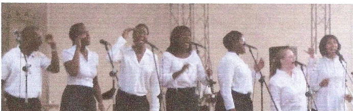
The London Gospel Choir

David was inspired to write Psalm 4, and in verse 2 asks, "how long will you have delusions and seek false gods?"